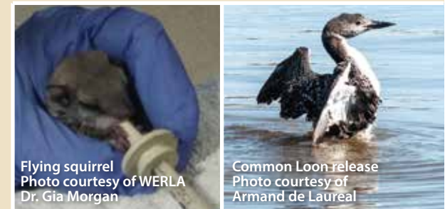
Flying squirrel!